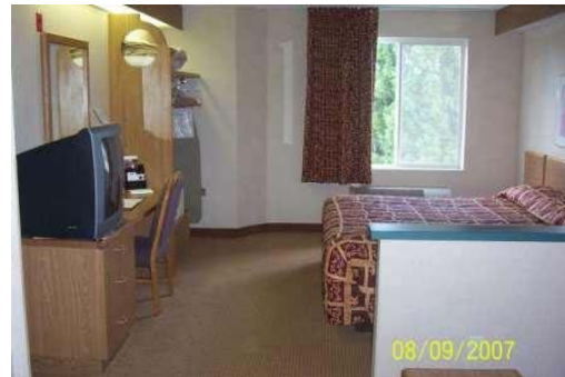
BEAUTIFUL INDOOR POOL AND GUEST ROOMS