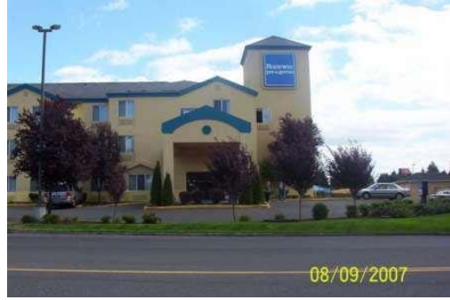
ATTRACTIVE ENTRY AND EXTERIOR FINISH, CLEAN AND WELL MAINTAINED